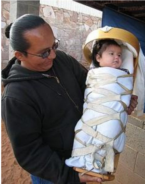
Image 6. Navajo cradleboard with head guard (Native Languages of the Americas 2013).