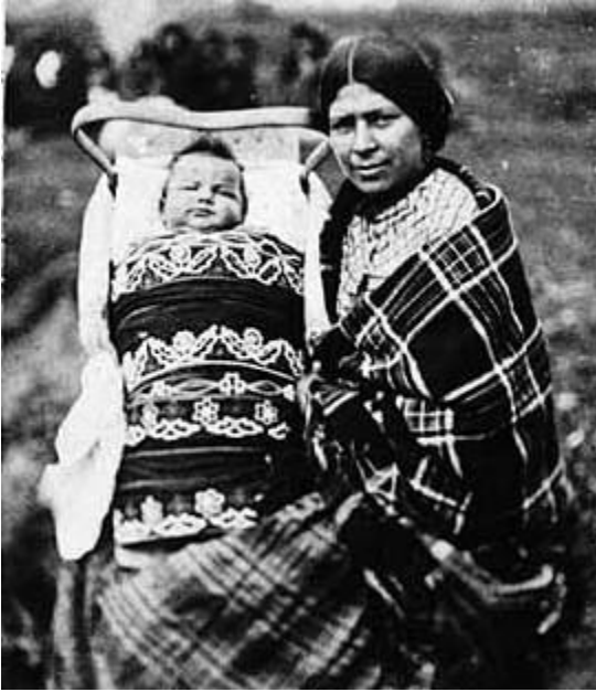
Image 7. Chippewa mother with child bound by cradleboard (Native Languages of the Americas 2013).