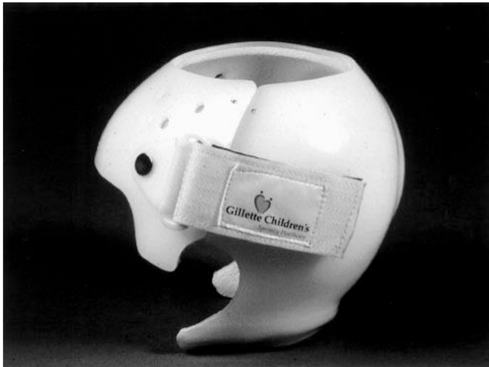
Image 4. Finished CranioCap with adjustable Velcro tab (Elwood et. al. 2004).